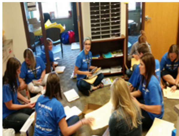
Summer Vacation Reality