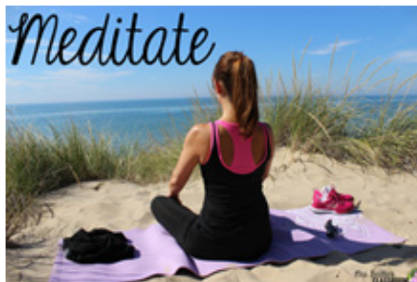
Summer Vacation Perception